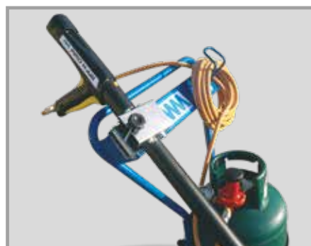
8 m GAS HOSE