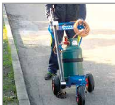
EXAMPLE OF METHOD OF USE