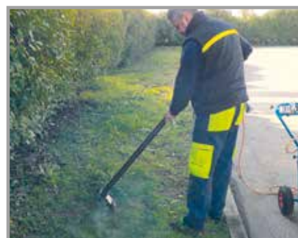
EXAMPLE OF METHOD OF USE